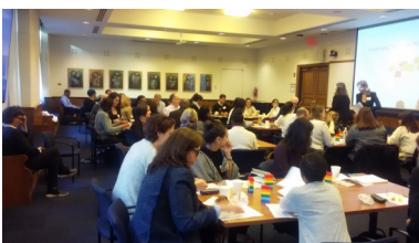
Group Activity for SEL Panel Discussion