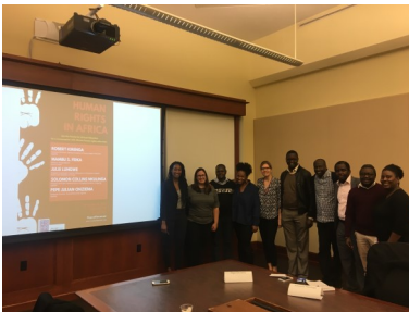
Human Rights Advocates and CAE Staff

In the fall, the Center hosted a coffee hour event for students, faculty and visitors with interests in the fields of Education and African Studies to connect with each other. The work of the Center was highlighted and upcoming events for the semester were presented.