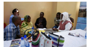
Staff at NUDIPU

“PWDs are literally and programmatically ‘invisible’ in refugee assistance programs.”