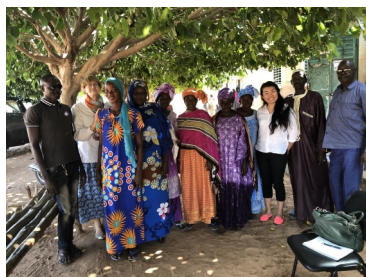
Research team with a school management committee

“Providing instruction in languages that learners speak and understand well has the potential to improve educational access, quality and equity, particularly for groups that have been marginalized in low-income countries”.