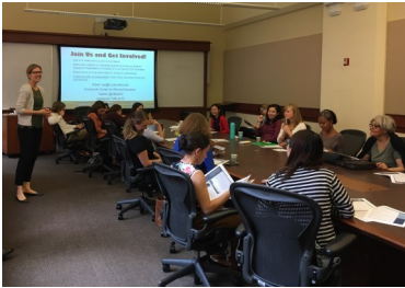
Students at the Coffee Hour