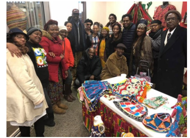
Vendors at the Harlem Market