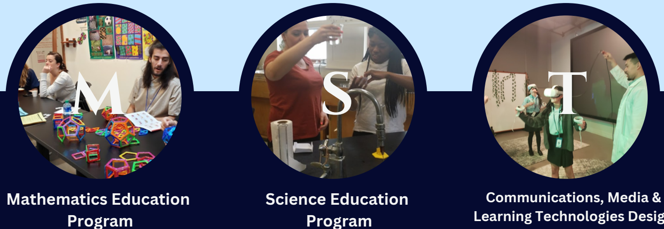
Learning Technologies Design (CMLTD)

Our experienced instructors are not just teachers – they're mentors, motivators, and supporters dedicated to helping you succeed. With their guidance and encouragement, you'll feel empowered to tackle challenges head-on and achieve your goals.