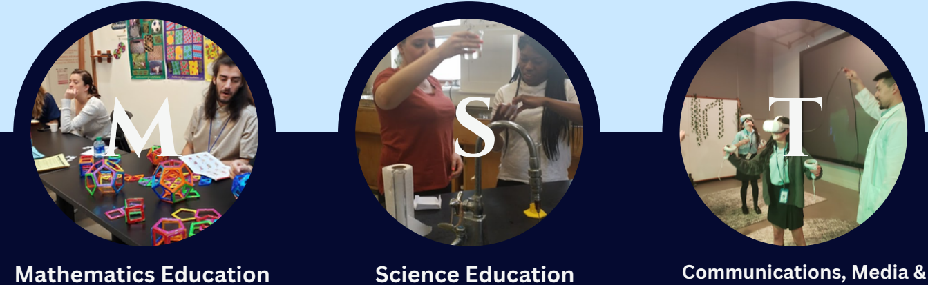
Communications, Media & Learning Technologies Design (CMLTD)

Whether you're looking to catch up, get ahead, or explore new subjects, our diverse range of courses has something for everyone. From core subjects to specialized electives, our expert instructors are here to guide you every step of the way.