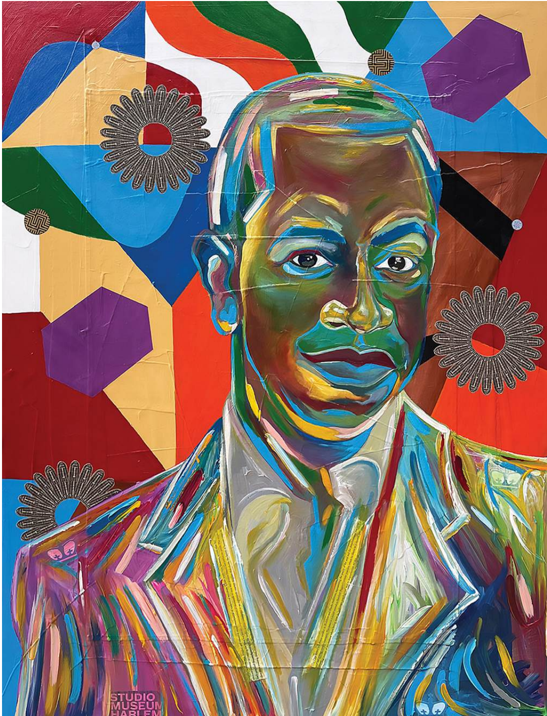
Symbolic Representation of Sanford Biggers (Black Male Artist/professor Series) Acrylic and paper on canvas 36" x 48" 2023