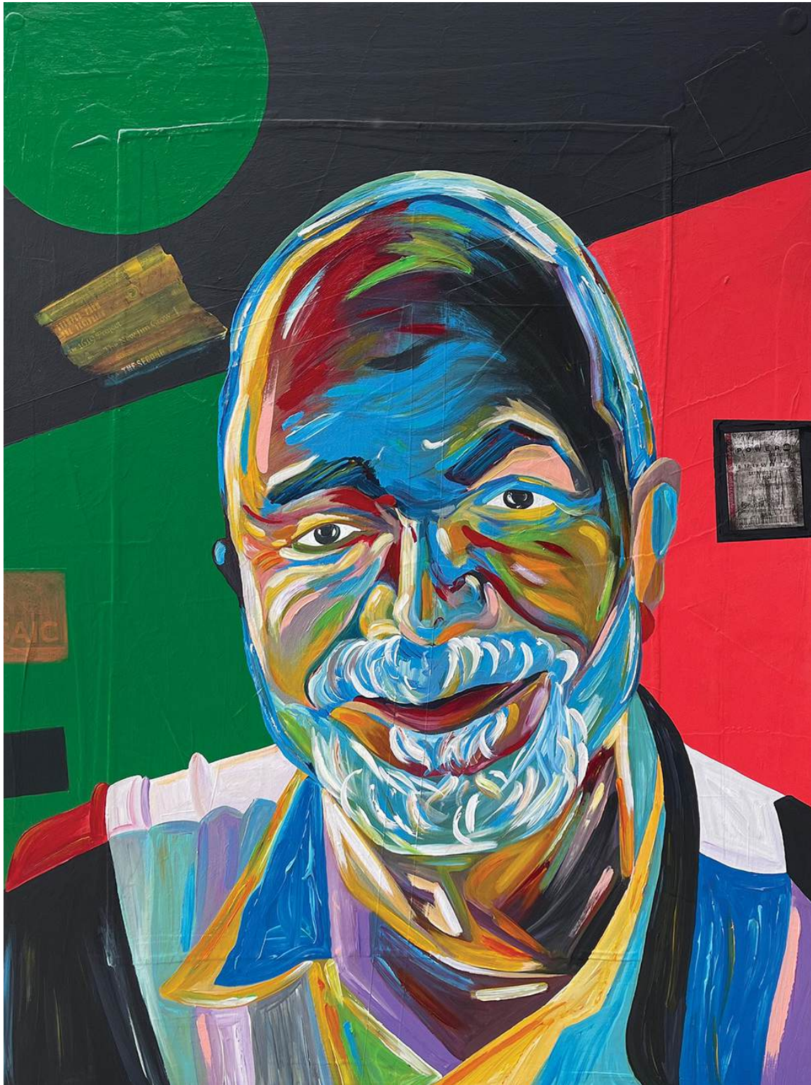
Symbolic Representation of Kerry James Marshall (Black Male Artist/professor Series) Acrylic and paper on canvas 36" x 48" 2024