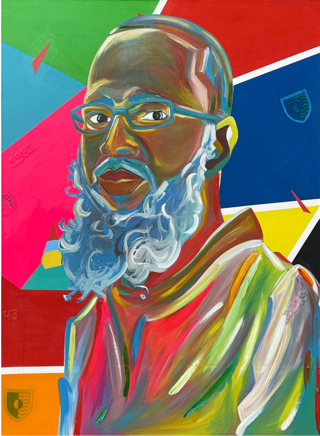
Symbolic Representation of Meleko Mokgosi (Black Male Artist/professor Series) Acrylic and paper on canvas 36" x 48" 2024