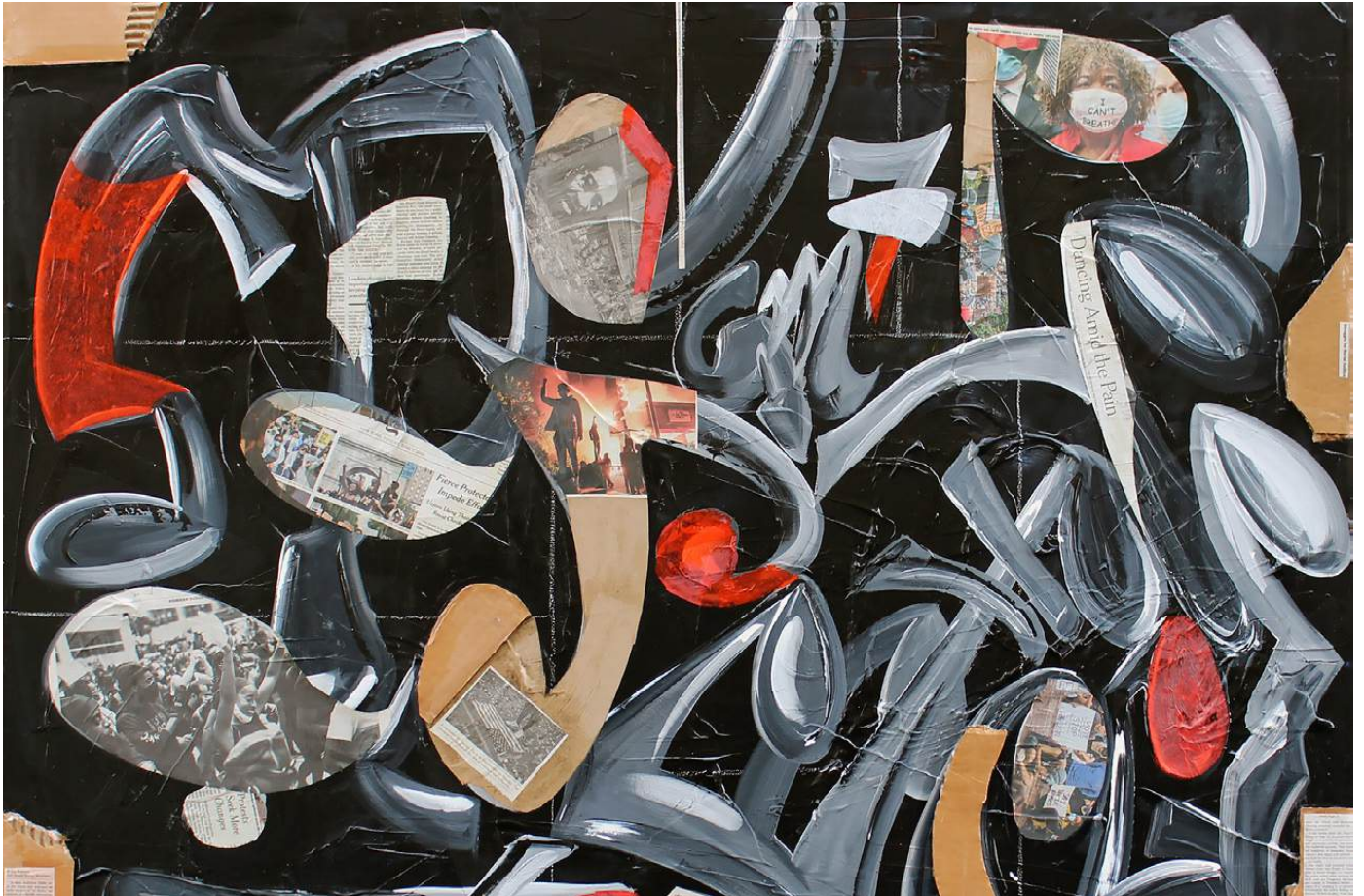
Inertia - Sounds of an Outcry for Change Acrylic paint, newspaper, cardboard, wrapping paper and construction paper on canvas