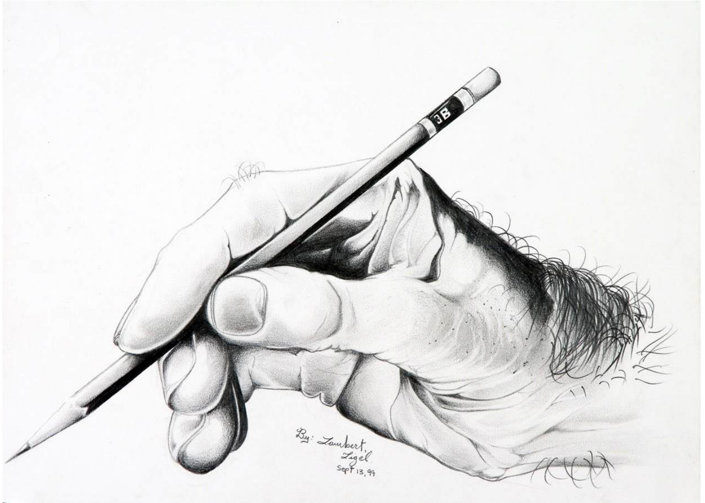
Hand with Pencil 9" x 12" Graphite on paper September 1999