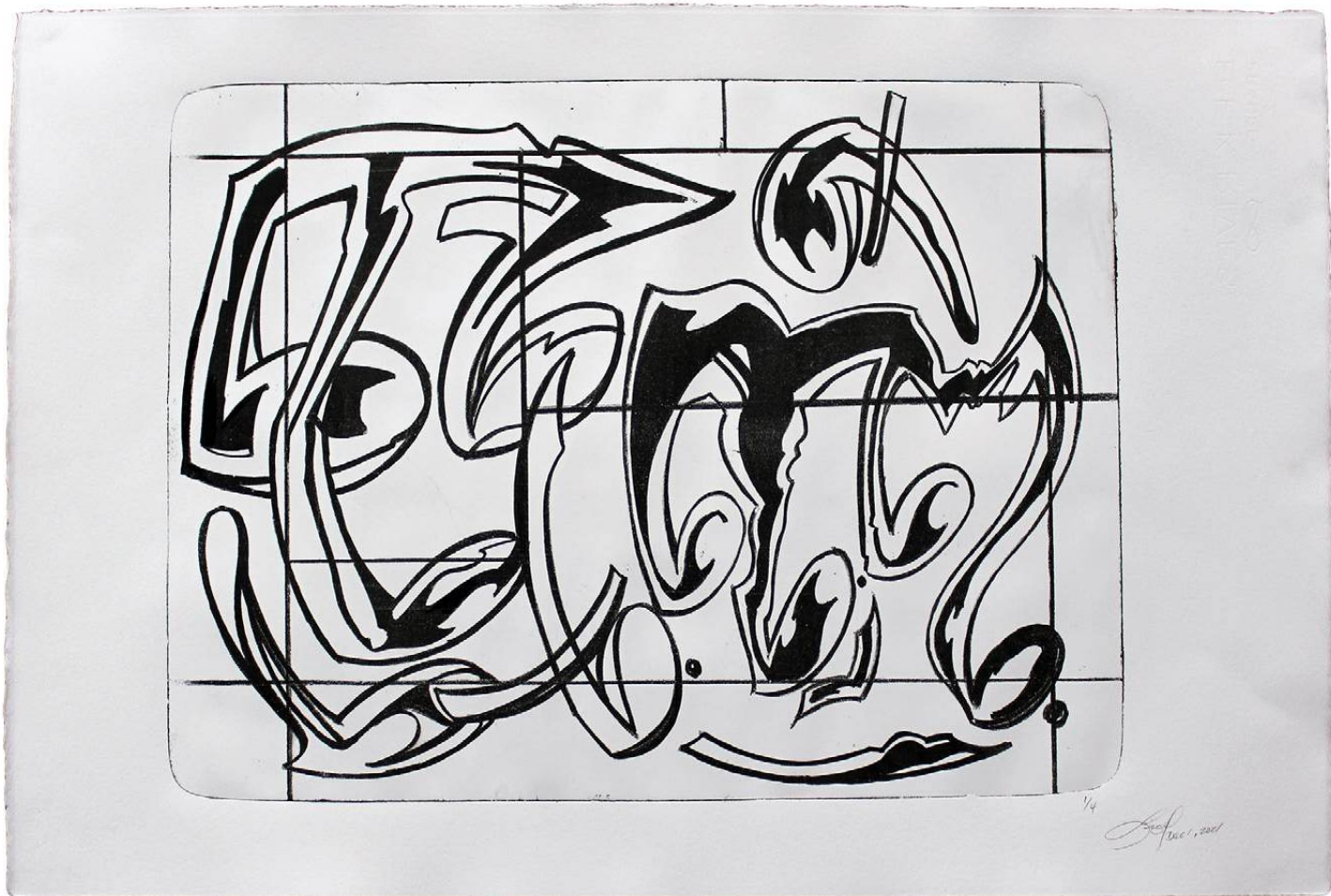
Improvisational Melody in 1/4 19" x 23" Stone lithography on paper December 2021