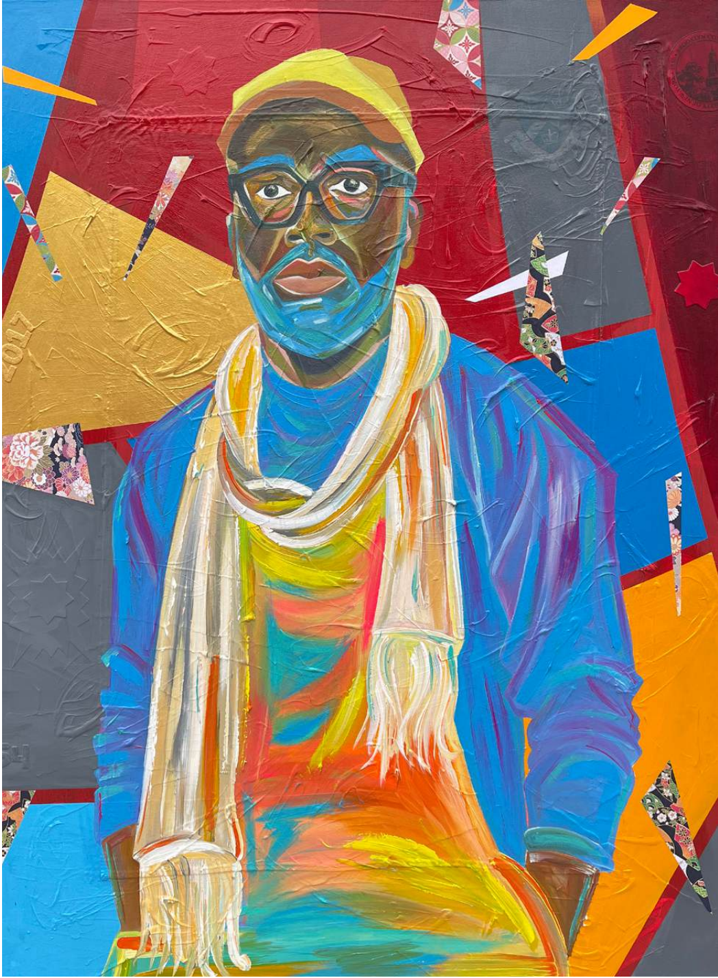
Symbolic Representation of Derrick Adams (Black Male Artist/professor Series) Acrylic and paper on canvas 36" x 48" 2024