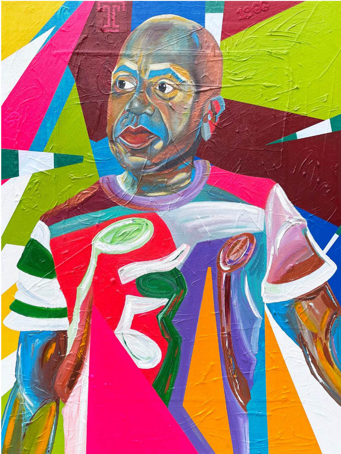
Symbolic Representation of Odili Donald Odita Acrylic and paper on canvas 36" x 48" 2025