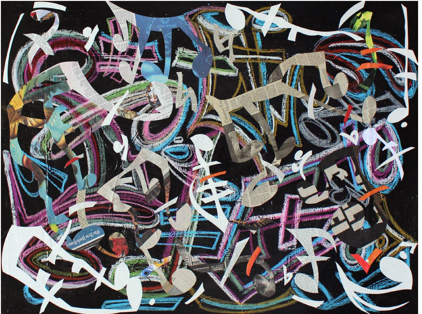
I Heard A Conversation About Voting Rights Again Acrylic, pastels, and paper of canvas 36" x 48" 2022