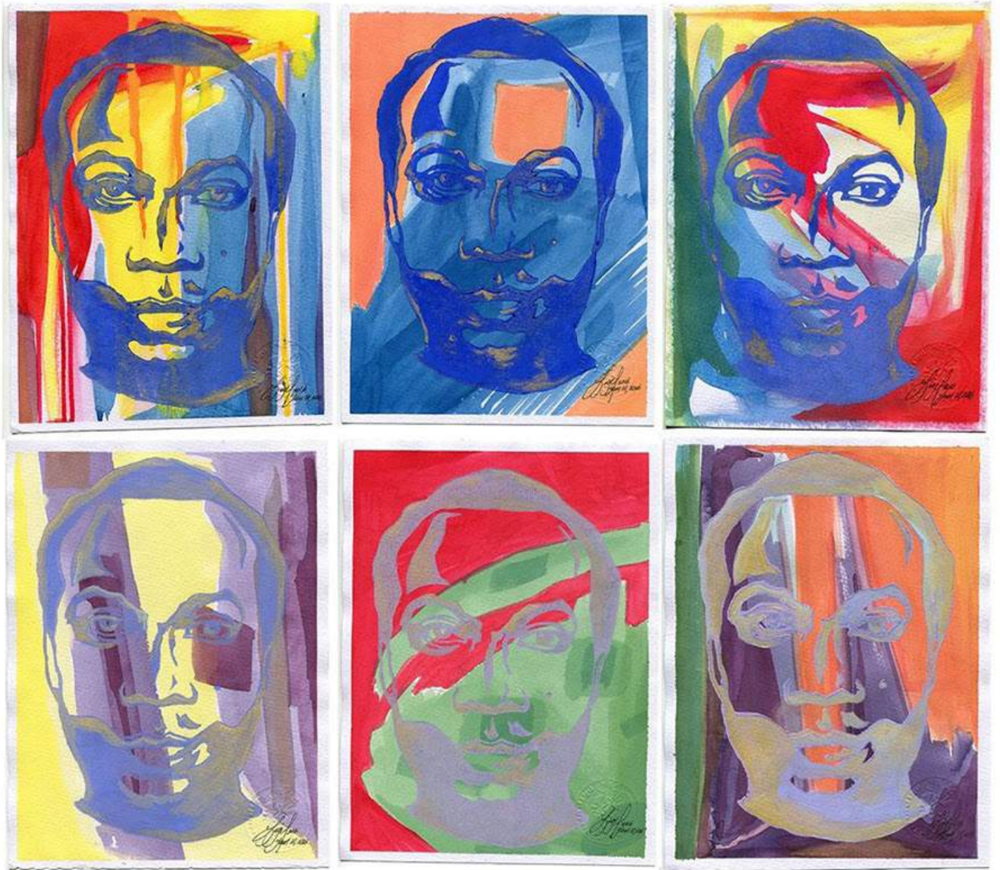
Portraits in Color #1 - #6 Woodblock print & watercolor on watercolor paper 7.5" x 10" (Each) 2016