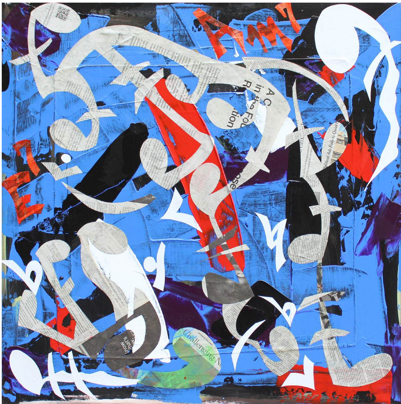
Visualizing the Amplitude of a Sound Waves Senk - Koulè Ble Acrylic and paper of canvas 40" x 40" 2022