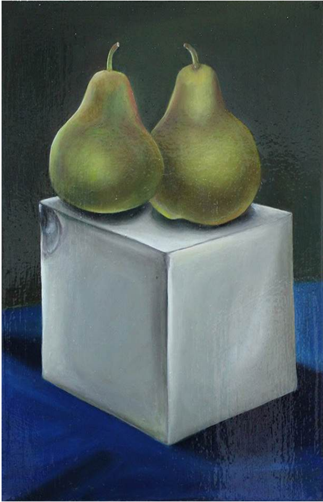
Two Pears Oil on canvas 12" x 16" 2016