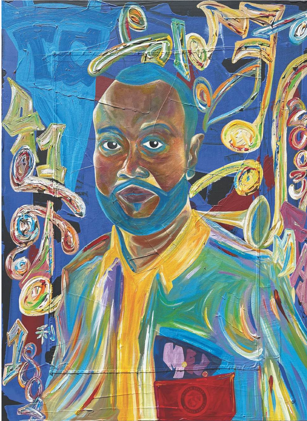
Self Portrait: Symbolic Representation of Self at 41 (Black Male Artist/professor Series) Acrylic and paper on canvas 36" x 48" 2023