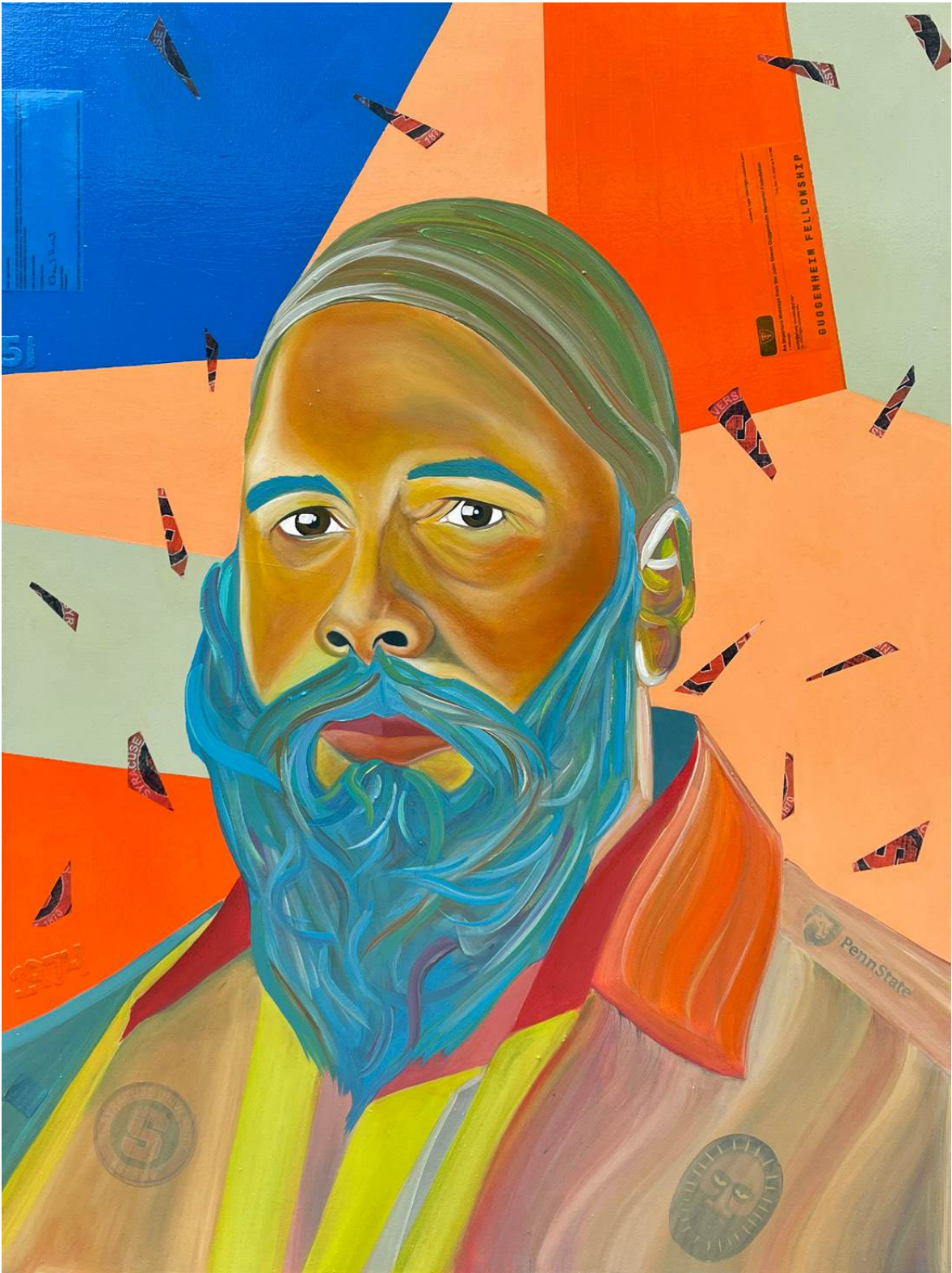
Symbolic Representation of Sharif Bey (Black Male Artist/professor Series) Oil and paper on canvas 36" x 48" 2025