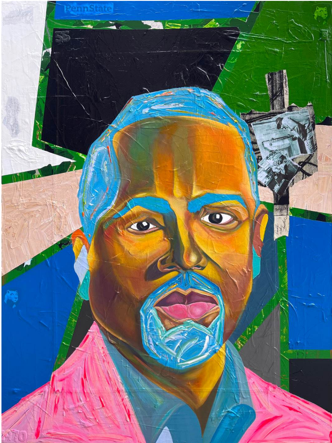
Symbolic Representation of Stephen Carpenter II (Black Male Artist/professor Series) Acrylic and paper on canvas 36" x 48" 2025