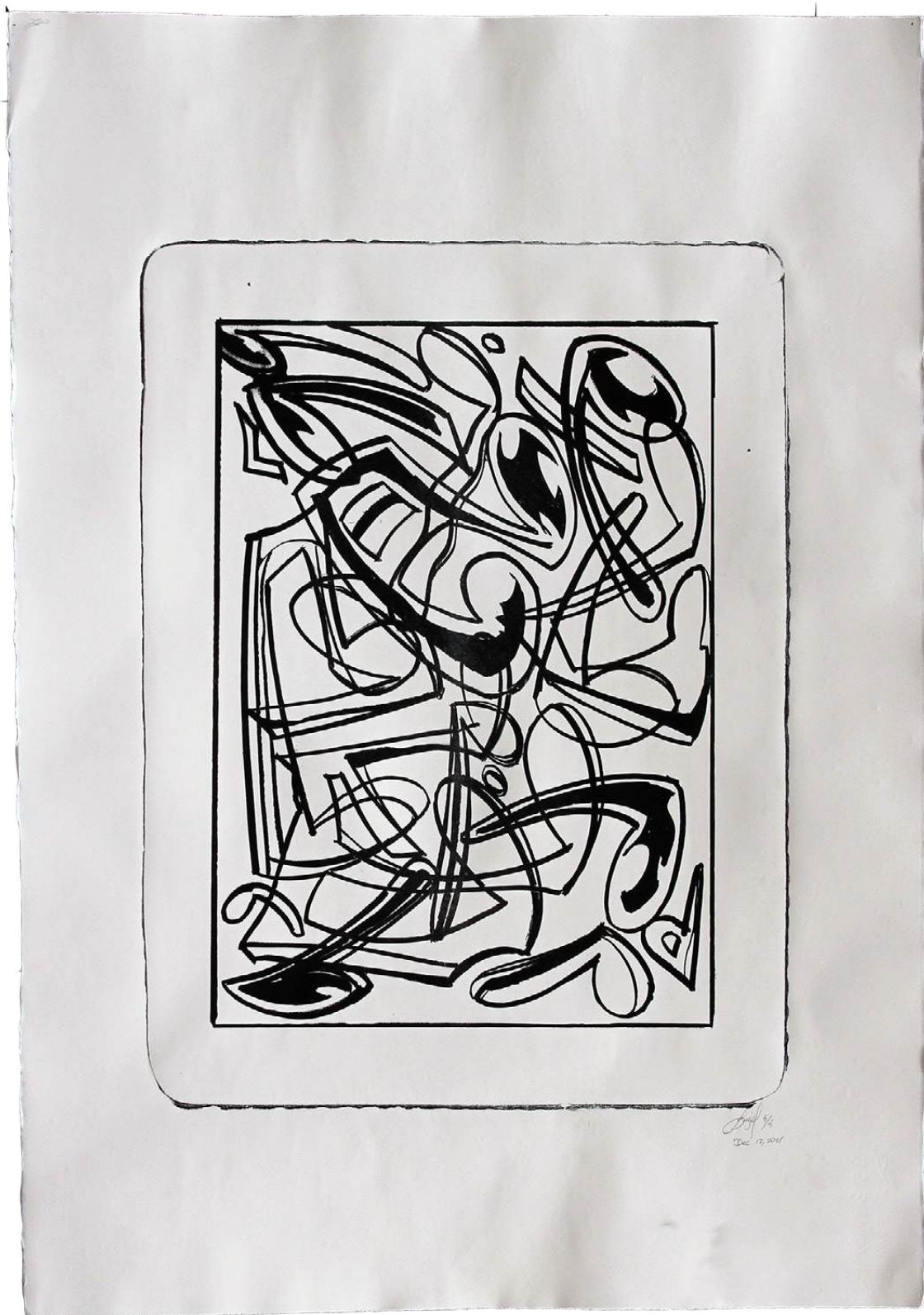
Hearing the Sounds in the Print Studio in 5/5 Stone lithography on paper 23 " x 35" 2021