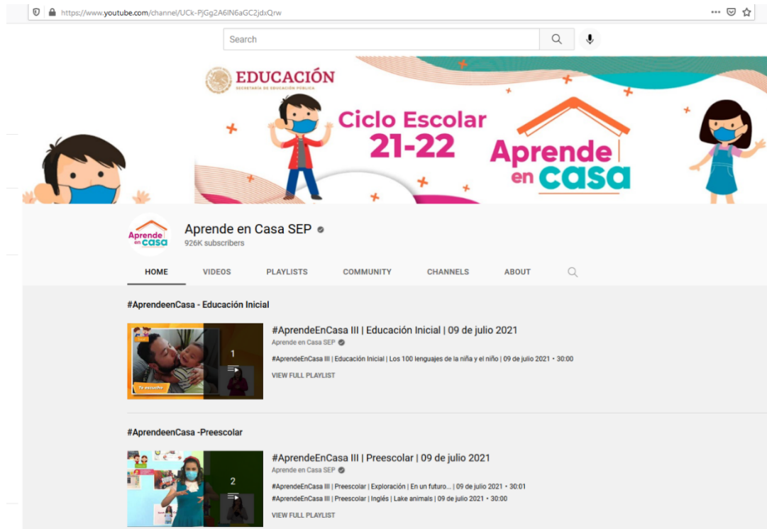
Figure 1 Official Aprende en Casa YouTube channel (November 8, 2021)