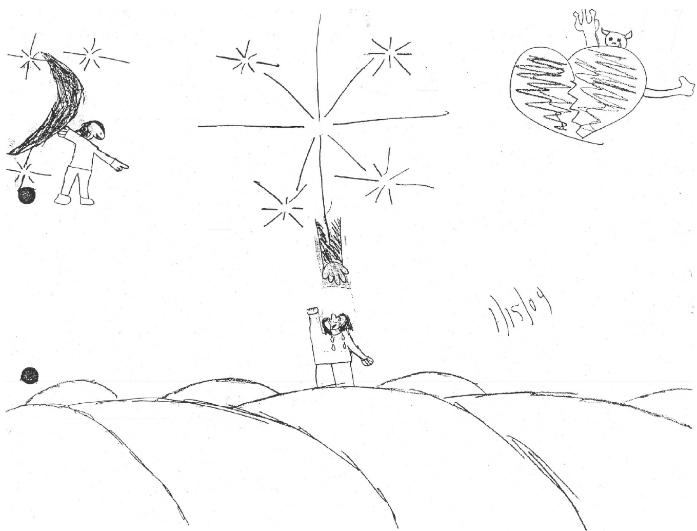
Figure 2. Amy's use of a symbolic language.

moon is her mother as an angel looking over her. The broken heart symbolizes her profound sadness, and finally, the devil hiding behind it represents the struggle between good and evil that claimed her mother. The devil speaks to her perception of the presence of evil or pernicious forces in the world that can do harm, such as drug use. The symbol of the devil could also refer to the manner in which she died (from drug abuse and prostitution). Seen from this perspective, the drawing also speaks to the difficulty (and perhaps conflict) children have processing grief from a stigmatized death (Goldman, 2000). The theme of the destructive power of drugs and violence manifest themselves in later pieces as well. The sequence of poems that will be presented here demonstrates Amy's progress through a healthy grieving process.