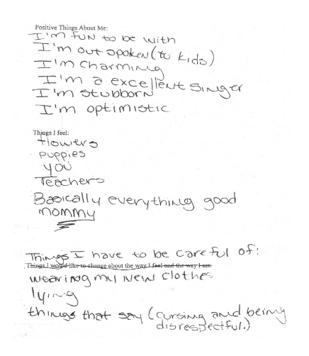
Figure 1. Amy's behavioral worksheet.