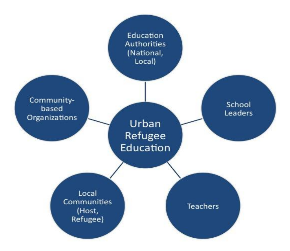
Image 1. Key national and local actors supporting urban refugee education