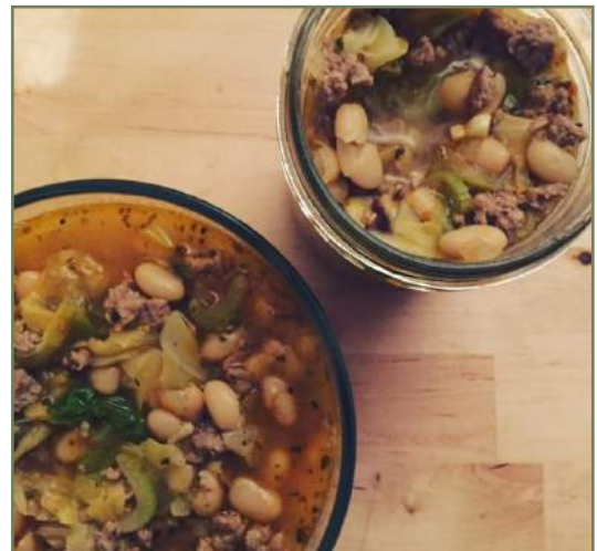
White bean and cabbage soup