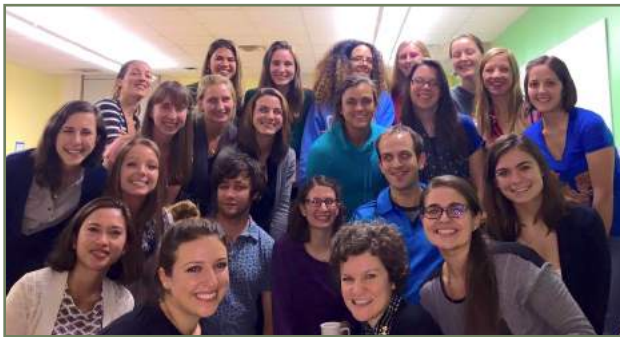
Left: Group shot from the holiday wine and cheese party hosted by the TC Health Nuts