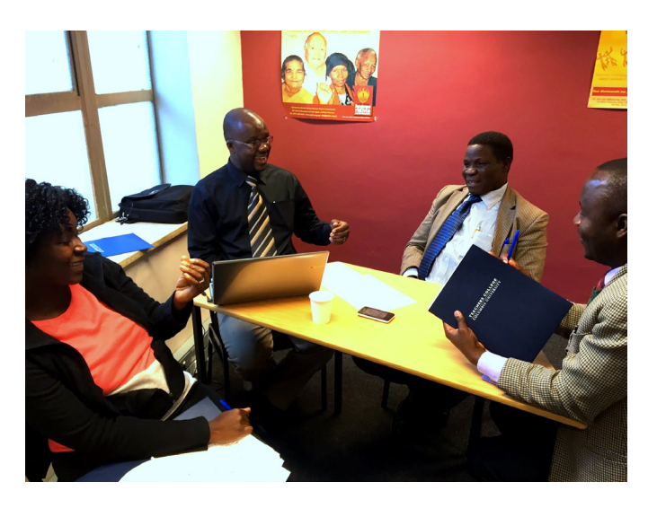
We aim to help teachers expose students of all backgrounds to high quality content about Africa and the African Diaspora.

Prior to the workshop, participant teams compiled and developed materials pertaining to their local work with civic education, and, more specifically, with issues of identity and belonging, human rights, and community engagement. After presenting initial ideas to the whole group, sharing feedback, and grappling with questions raised, the group came to a consensus about the need to focus on increasing the capacity of educators and community leaders to facilitate civic education and engagement with students and communities. Participants worked together to produce interventions aimed at various groups of stakeholders in their local contexts. Some