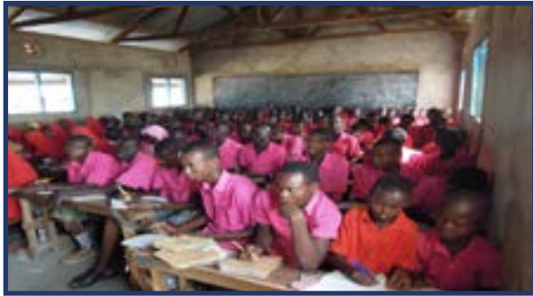
Lokitaung Primary School, Kakuma Refugee Camp