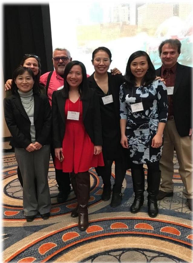
The 2018 AAAL Conference in Chicago, Illinois