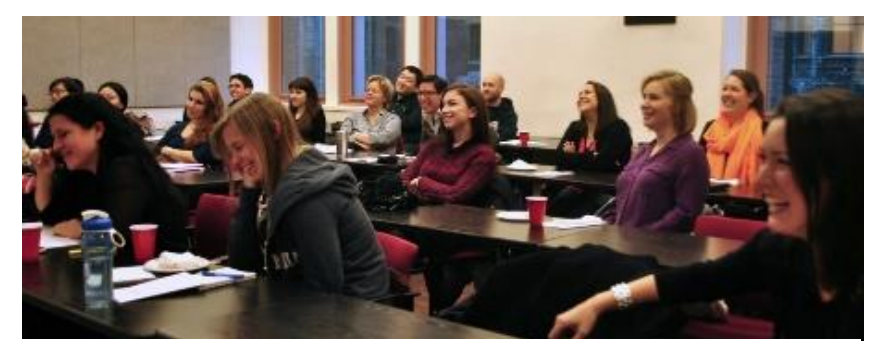
A lively and inquisitive atmosphere at the fall Roundtable Research Forum.

This past year, the student-run TESOL/AL Roundtable organization made a few key changes that enabled a marked increase in overall participation and allowed the group to explore new directions. Eight officer positions were added, which created leadership opportunities and made it (continued on page 9)