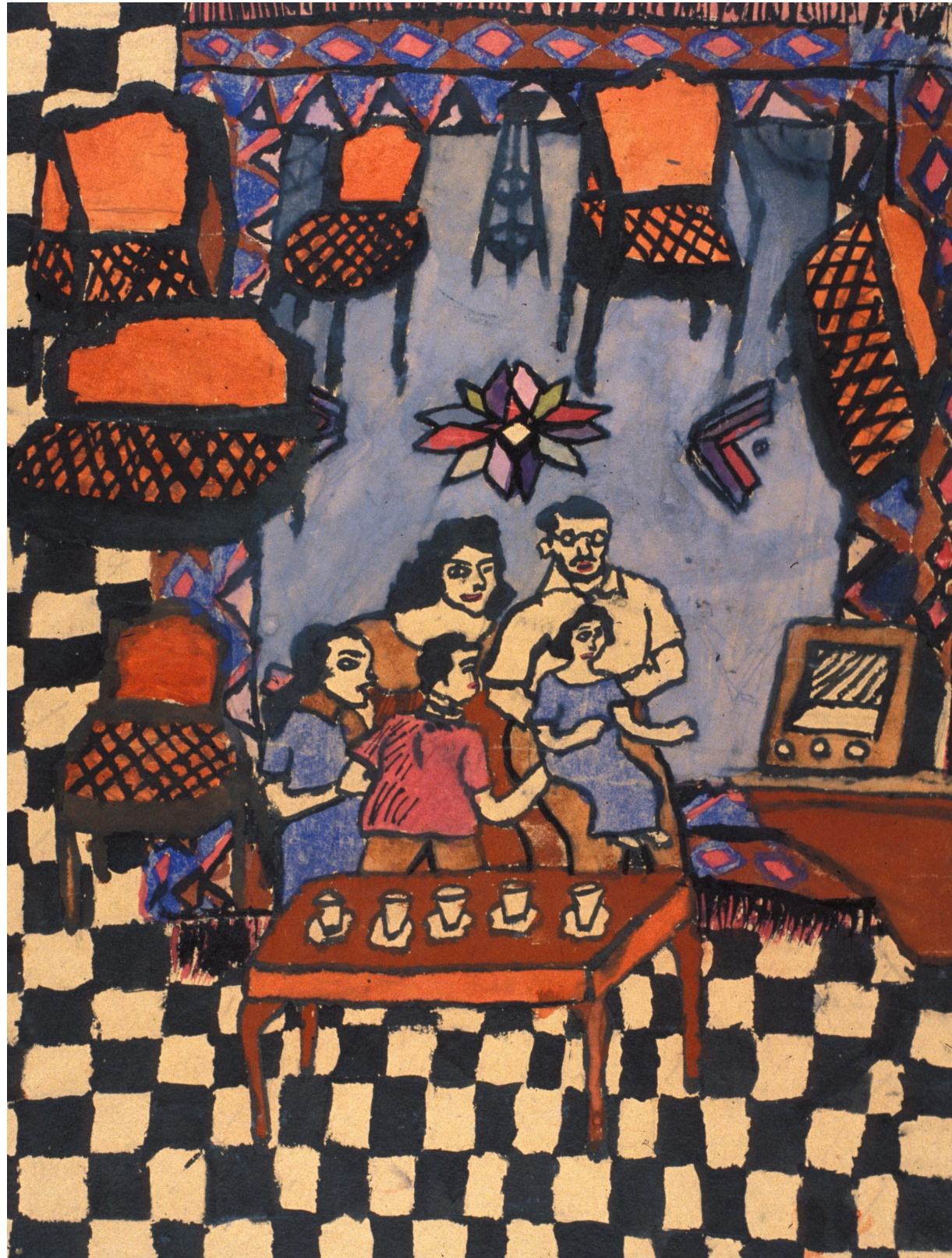
A family listening to the radio [Cairo, Egypt].

▲ The images throughout this program were generously provided by the Gottesman Libraries at Teachers College.