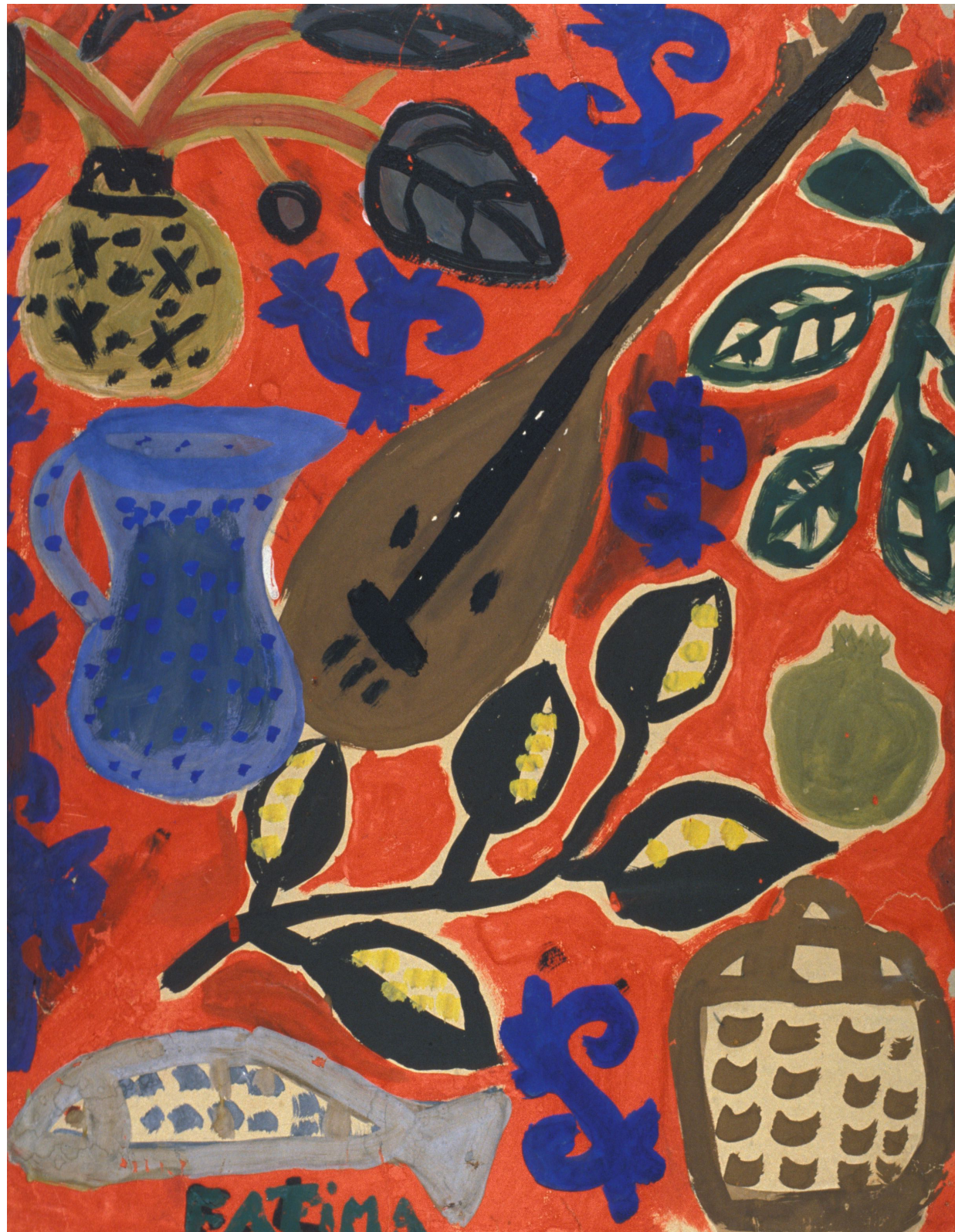
Fatima (Surname Unknown) (1955). Still life [Morocco]. Ziegfeld Collection, Gottesman Libraries, Teachers College, New York, NY.