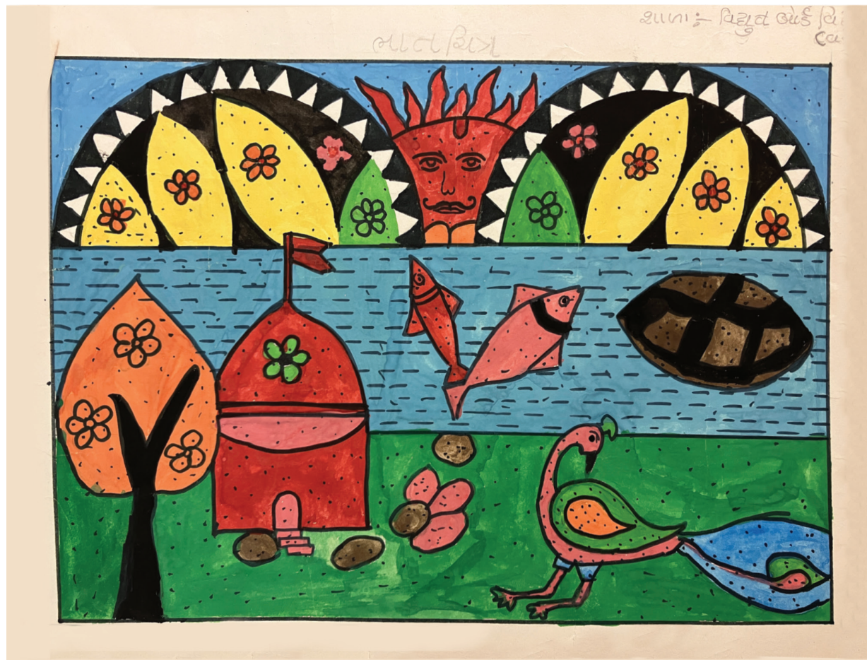
Nature scene. (n.d.). [Mixed media]. Indian Art Collection, Gottesman Libraries, Teachers College, New York, NY.