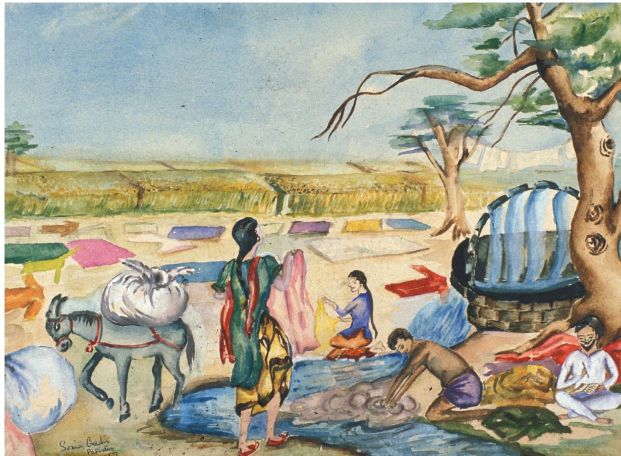
Qadis, S. (1957). A village well [Lahore, Pakistan]. Ziegfeld Collection, Gottesman Libraries, Teachers College, New York, NY.