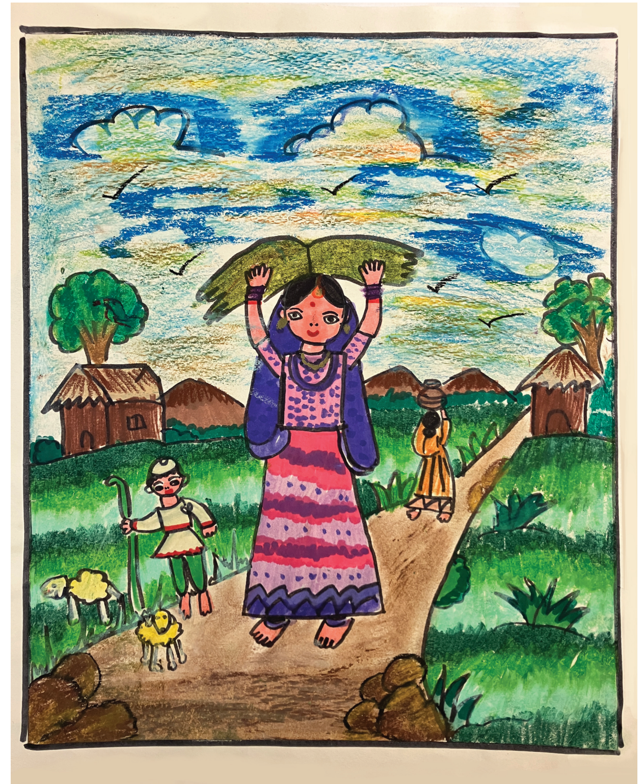
Village belle. (n.d.). [Mixed media]. Indian Art Collection, Gottesman Libraries, Teachers College, New York, NY.