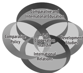
Figure 1. Disciplinary Approaches to South-South Cooperation and Transfer

In this framework, this article will outline how the fields of comparative and international education, comparative policy, international relations and development studies have each approached South-South cooperation and transfer, and will attempt to indicate the existing intersections among those fields.